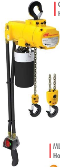
MLK Chain Hoist Series